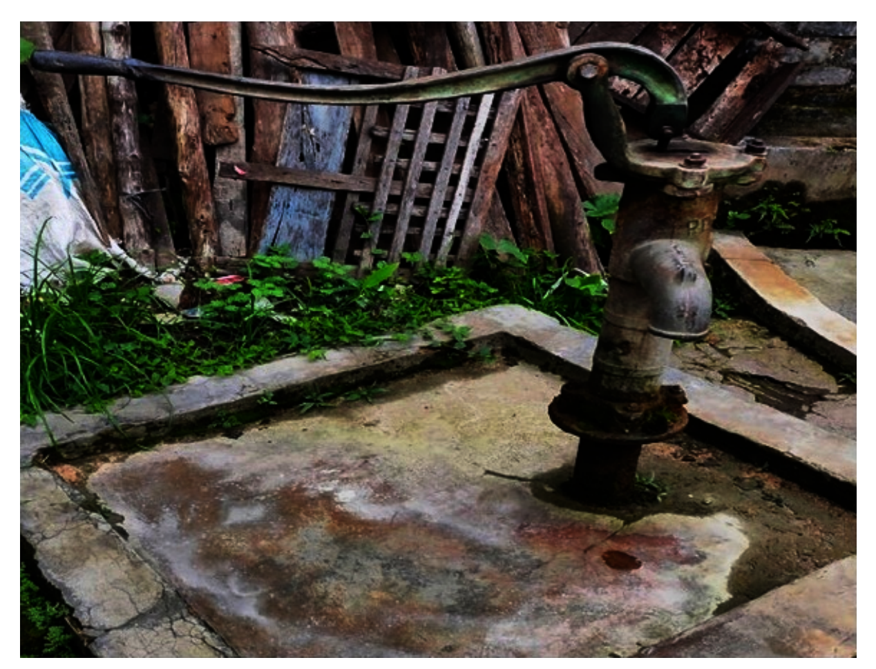
Figure 1 A tube well from an As contaminated area in West Bengal, India