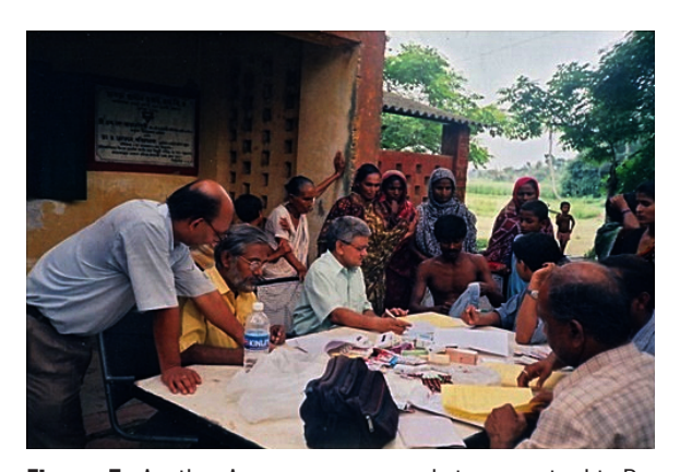
Figure 5 Another As awareness camp being organised in Deganga Block, North 24-Parganas, West Bengal, India (Source: Grant No: F.PSW-022/03-04)

Based on a field experience of nearly two decades in Bangladesh, Ahamed et al. (2006b) emphasized the importance of creating awareness among people in connection with the As problem, role of As-free water, better nutrition from local fruits and vegetables, and, above all, active participation of women along with others in the struggle against this danger. Only then would a mitigation programme yield fruitful results. In another study from Bangladesh, it was observed that an individual's awareness about the As threat